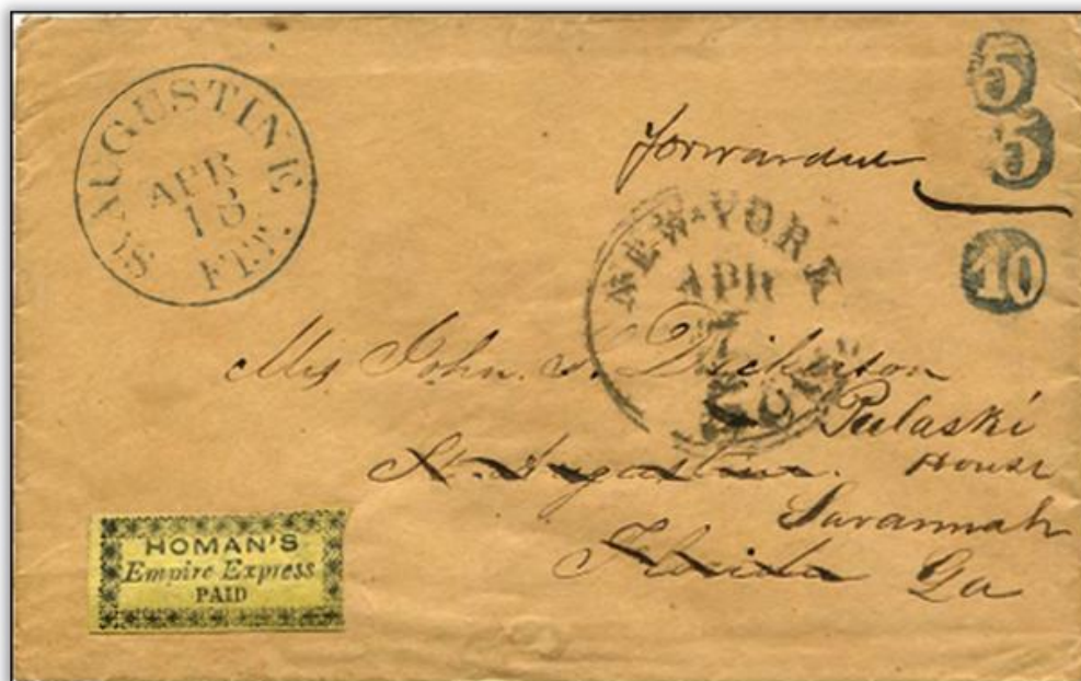
Figure 1. Black Apr 18, [1852] ST. AUGUSTINE FL.T. Type XIV DH.

The 5 and 10 handstamp markings are both struck on the forwarded cover shown below in Figure 1. The first negative 5 restated the original due postage and the second negative 5 the forwarding postage. The two handstamps were summed up to yield the negative 10 due. The ST. AUGUSTINE FL.T. Apr 18 [1852] circle date handstamp (CDS) is a Type XIV used between December 30, 1845, and November 21, 1854. Black, red, and blue-green color CDS are known to be used during this time period.